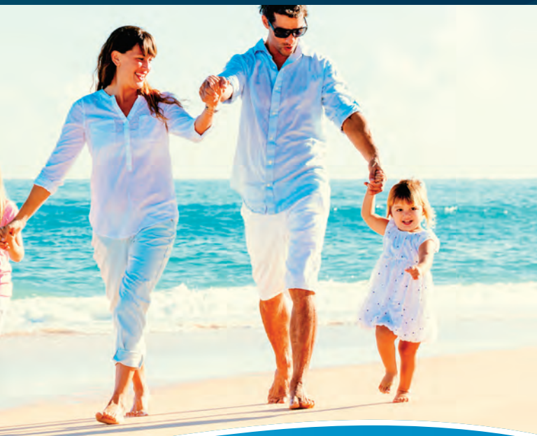
Jetty Park air-conditioned beach-side cabins

As part of a recent $1.13 million park renovation, Jetty Park's extensive tent and RV camping facilities have been joined by eight new vacation cabins. Each cabin is 12-feet by 15-feet and sleeps four, plus each has its own themed décor, from "Surf Shack" to "Smooth Sailing."