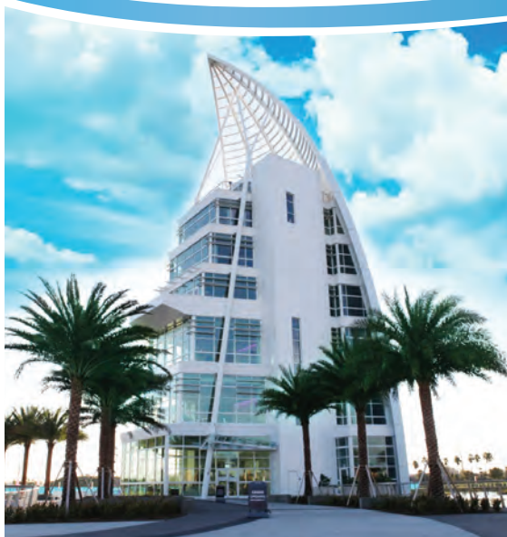
Exploration Tower at Port Canaveral

At Port Canaveral, you're in the midst of a unique part of Florida with its own special history, natural environment, wildlife, sports, technology and local culture. Even if you've been here before, you'll find there's still a lot more to discover about Florida's famed Space Coast, and the best place to do that is right here.