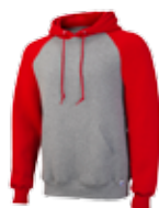
OTD OXFORD / TRUE RED