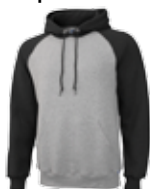
OBK OXFORD / BLACK