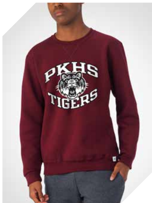
TTR TRUE RED

10% UPCHARGE FOR 3XL AND 20% UPCHARGE FOR 4XL