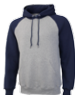
OFN OXFORD / NAVY