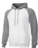
WHF WHITE / OXFORD