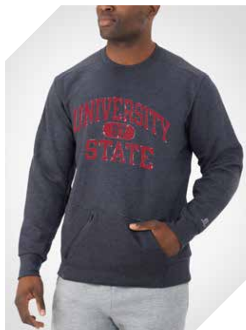
A7I CHARCOAL GREY HEATHER

10% UPCHARGE FOR 3XL AND 20% UPCHARGE FOR 4XL