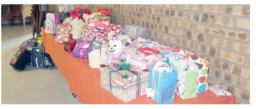
These gifts were handed out to children.

"Famsa would like to extend its gratitude to all the stakeholders involved in making the OVC Care Programme a success and we look forward to be working together next year.