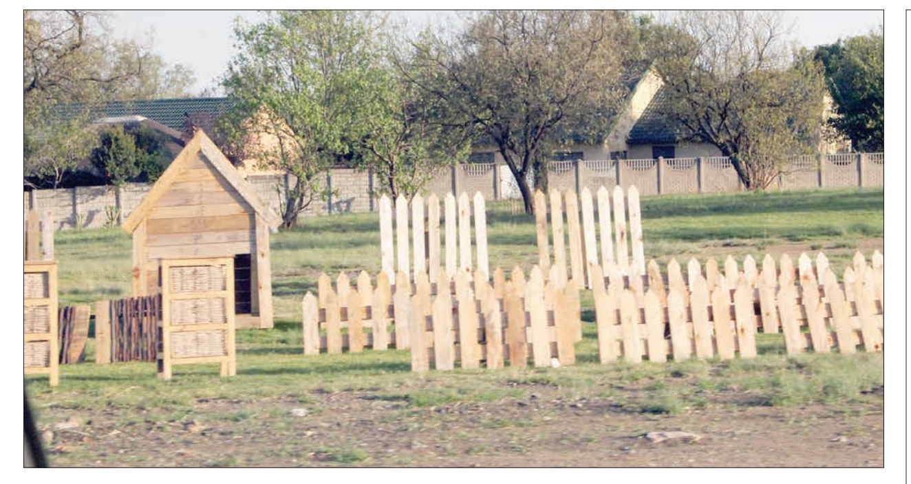
Hawkers selling wooden dog houses and other goods on the road between Secunda and Trichardt pose a problem for and are an irritation to residents living nearby.