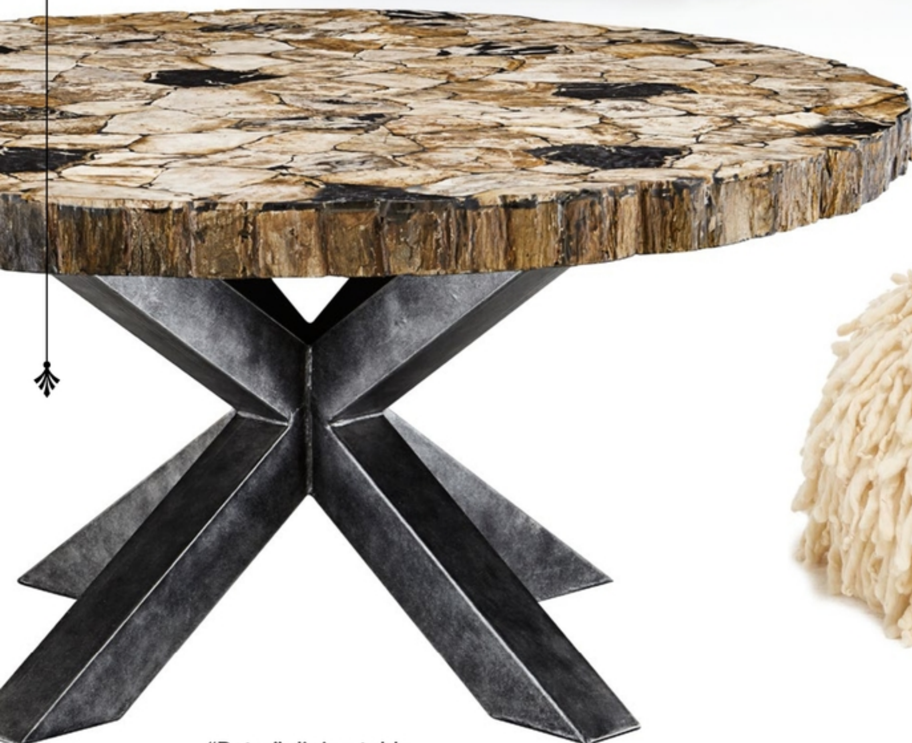
"Petra" dining table $5,999, Arhaus