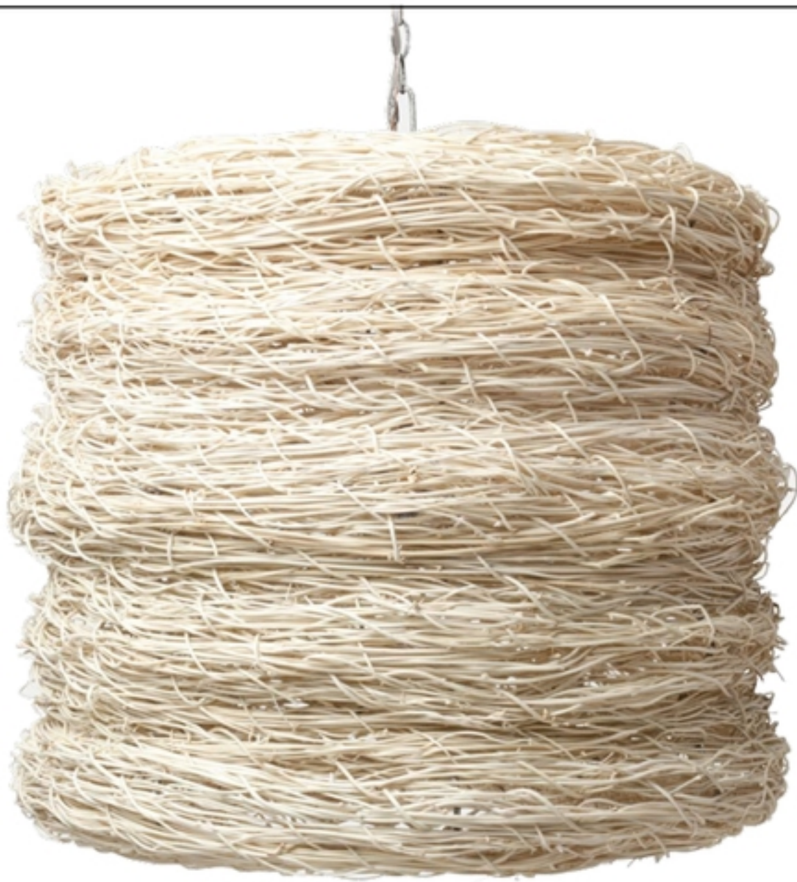
"Corina" chandelier $1,700, Made Goods