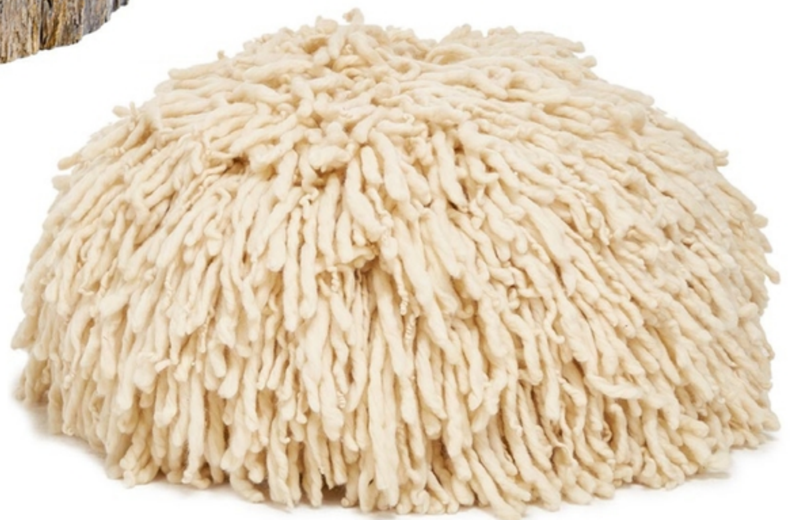
Arcade Avec "Rasta" pouf $1,495, ABC Home