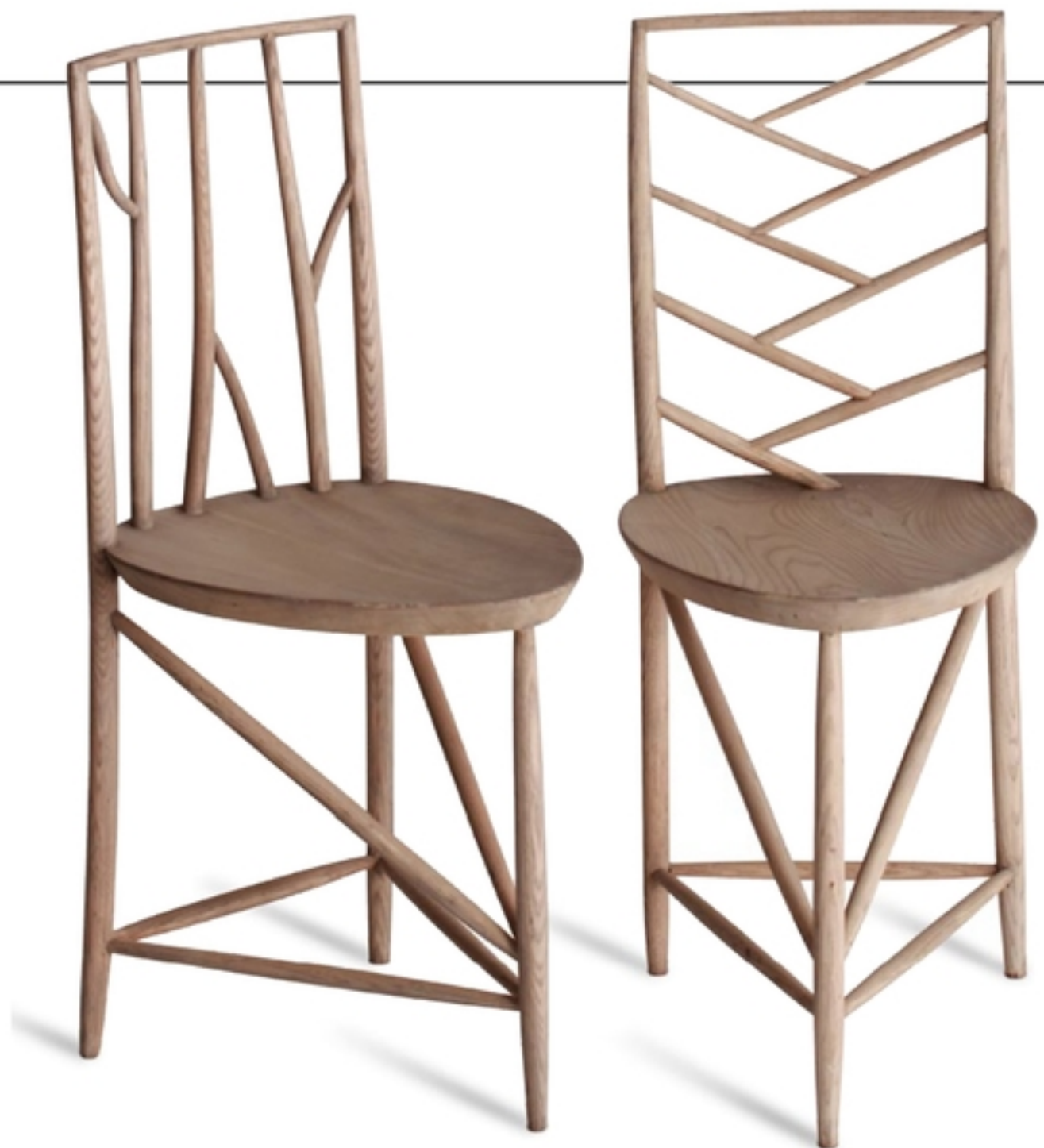
"Twig" and "Herringbone" chairs $4,095 each, Porta Romana