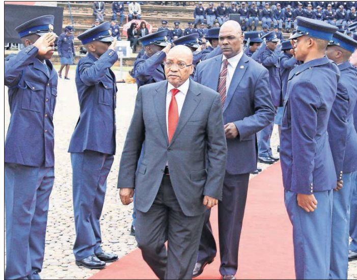
President Jacob Zuma on his way to lay a wreath in honour of killed police officers.

The criminals who terrorise communities and who kill our police officers must not be protected." Zuma said members of the public must also refrain from behaviour that perpetuated crime.