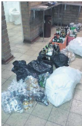
Brooklyn police confiscated 447 bottles of liquor (more than 200 litres) from a guesthouse dealing without a liquor licence.

"Intentional false statements under oath