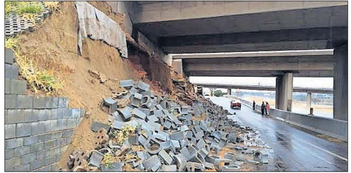
Heavy rain caused the hill to partially collapse next to the bridge on the N14/R55 to Krugersdorp on Saturday.