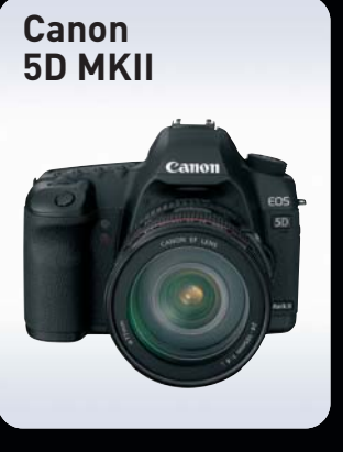
All prices exclude 15% damage wavier and VAT.

Weekend deal 3 for 1 Rent for 3 days, pay for only 1! Collect Friday, return Monday by 10am